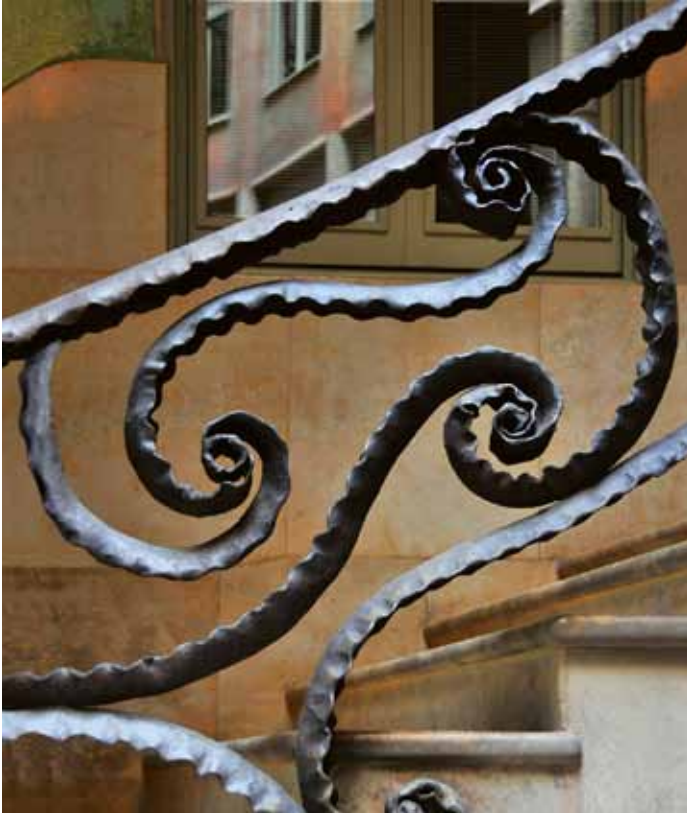
"Gaudi Handrail, Barcelona,"