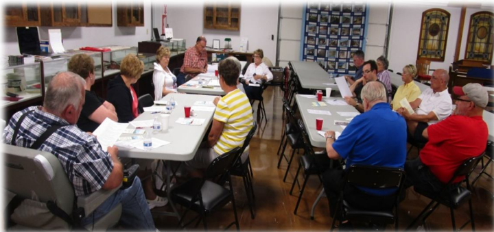
Directors of Penn Colony and interested Colony members attend the summer meeting of the board.