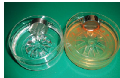
Comparison in pure water (Left: Made of stainless steel)

Working up to 0.5 mm allowed on the attractive face.