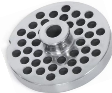
2 Plates Included (6mm & 8mm) Additional Accessories Available Upon Request

** Due to continuous product improvement, specifications are subject to change without notice.