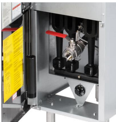
Inside View of Drain & Thermostat

** Due to continuous product improvement, specifications are subject to change without notice.