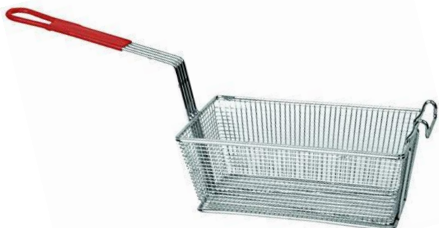
Fryer Baskets Included