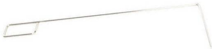
Drain Rod Included