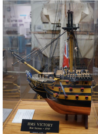
HMS Victory Bow Section