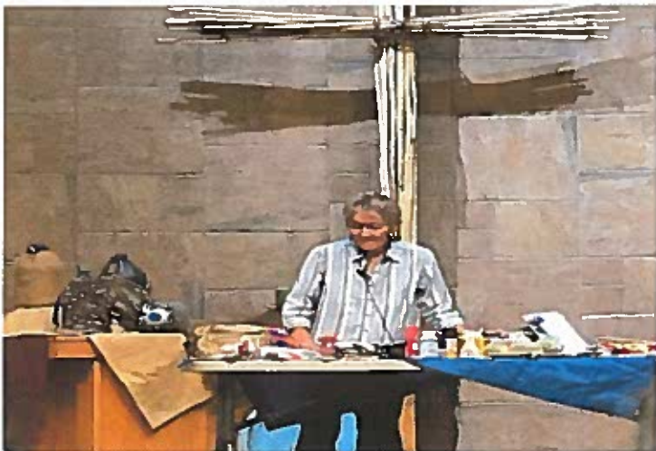
Member of Mission