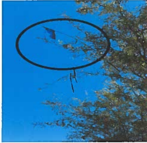
Flag to indicate water barrel