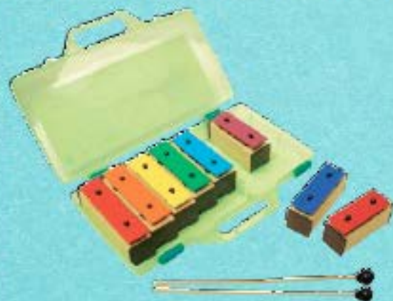
Basic Beat Resonator Bells

Xylophone Fun was created to offer a basis for introducing music reading in preparation for beginning piano. Children are able to first match color and then the letters from the visual to the xylophone or bells. Doing these simple songs offers exercise in letter recognition, matching, basic reading skills, fine motor skills, and basic music reading skills.