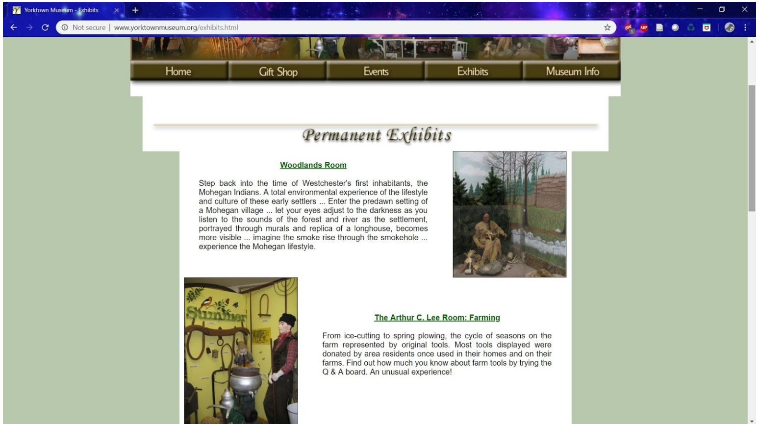
Screenshot of "Exhibits" page on the Yorktown Museum website

Permanent exhibits are displayed on the website, but only provide a brief description and picture showing only a portion of each. Paired with each exhibit is a packet for self guided tours, as information plaques are minimal throughout the museum. These packets provide details on the objects within an exhibit and create a short little walkthrough for how a visitor can approach it. A staff/volunteer member is always available to provide tours, and the office is always open for those with questions on the exhibits.