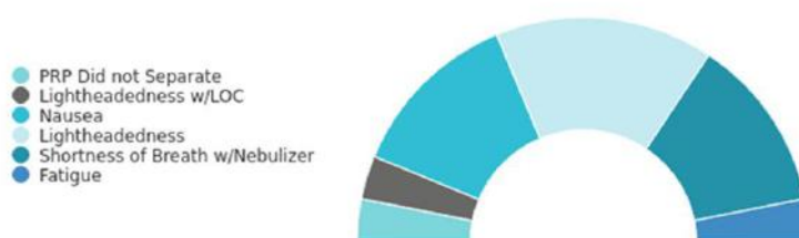
Figure 2: Adverse events by type.