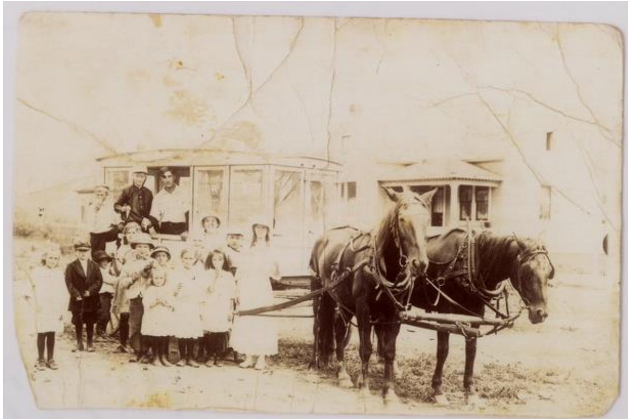
Picariello's ice cream wagon, Fernie, FM 1222