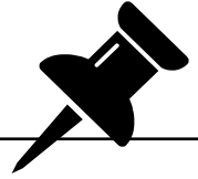
2021 Membership Activities Calendar ( Proposed )