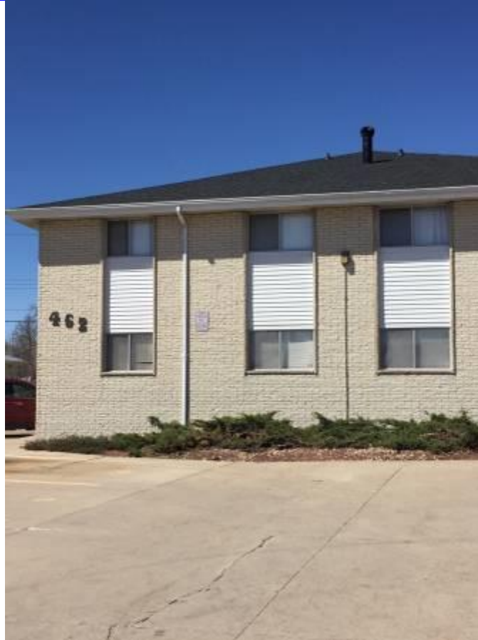
462 S. Randall Ave near Racine Street