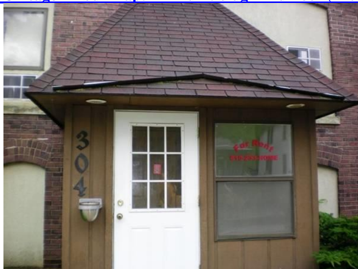
Chicago near Clark

$390 / 1br - 304 N. Chicago - 1 bdrm apt in 12 unit bldg - 2nd floor (Freeport)