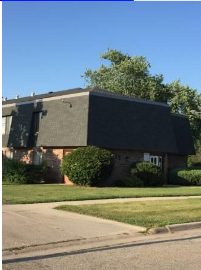
Conde near Washington