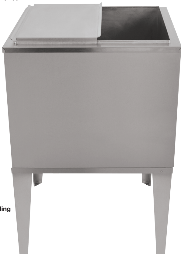
Free Standing Ice Chest 23" x 21"

Lancer's IC 400 Ice Chests are designed using the highest quality materials and proven technology providing our customers with consistent drink quality.