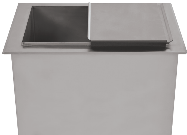
Drop In Ice Chest 22" x 15"