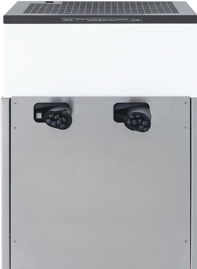
CED 1500 Prechiller

□ 500 (2cir) □ 1500 (4cir) □ 1500 (6cir) □ 2500 (4cir) □ 2500 (9cir)