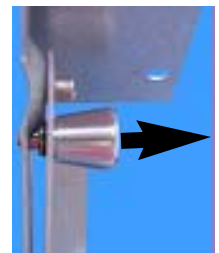
FS30 Unit Figure 3