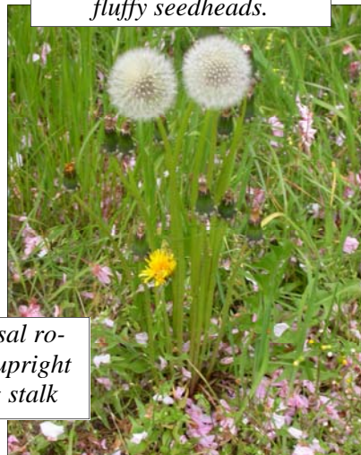
Form: Basal rosette with upright flowering stalk