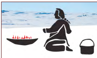
Design: Pirnoma Technologies

Saturviit contracted design and implementation of a web site, www.saturviit.com , to Pirnoma Technologies, a Nunavik company based in Ivujivik. The site was to serve two functions: a public side, to disseminate information on the Association, its projects, membership news, useful links, and to invite input from the public; the internal side was designed to facilitate communication, scheduling, document sharing, amongst directors and staff. During 2011, the site was installed and functioning, but not intuitively user-friendly by either public or internal users. It will be overhauled in future.