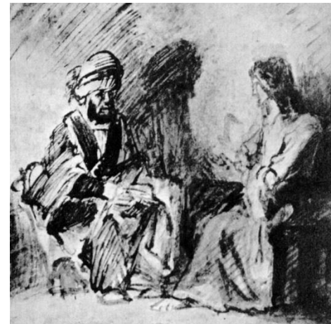
Jesus and Nicodemus