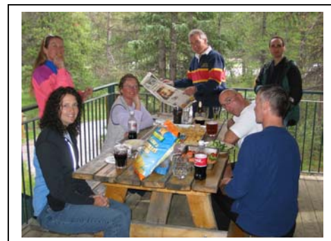
Banff to Jasper 2005 See page 7

Meet at the Sherwood Park Alliance Church on Wye Road at 9:30 AM. Leave at 10:00 AM SHARP. We will spin our pedals east on Wye Road as far as our hearts desire in 1 hour and 15 minutes and then turn around to head back to our starting point. The distance covered will depend on the rider. There are no designated rest stops. This is a non supported ride so be prepared to handle the usual minor hiccups that can occur and ensure you have proper hydration. Coffee follows at the Tim Horton's in the mall across from the church.