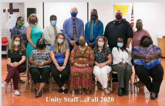
Unity Staff ... Fall 2020