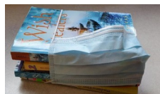
Books in Quarantine

The library ladies are working incredibly hard! Because of Covid, they now have to take books to the rooms on a cart, and in between, the books are put in quarantine for a few days to make sure they are germ free to go back on the cart and to be shared with the next class. Also, because of a computer hack over the summer, we lost all the information on our library books. A donor has given money to purchase a new system that has a great backup.