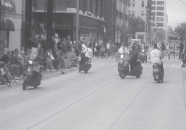
Waukegan Motor Patrol