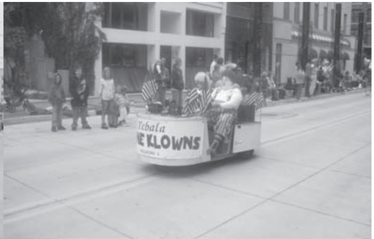
Loves Park Shrine Club