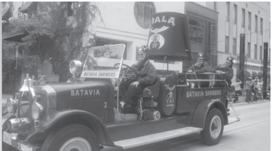
Batavia Shrine Club