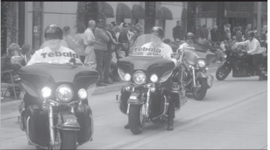
Dresser Shrine Club