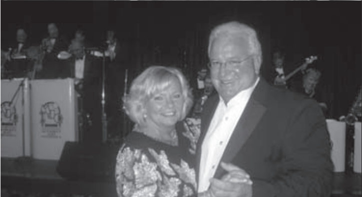
You Can't Beat the Shrine