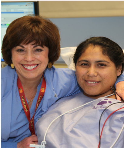
Medical professionals volunteer their services to provide donated care for the uninsured.

PASD's work benefits the populations we serve: patients, clinics, and volunteer physicians, as well as the healthcare system and other healthcare organizations countywide. Here is how we benefit our community: