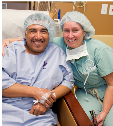
Medical volunteers donate their time to help PASD patients get well and back on their feet.

Patients surveyed also reported their use of hospital stays during the six months prior to their Project Access enrollment and after they received care; Project Access demonstrated a 94% reduction in inpatient days and hospital costs for uninsured community residents.