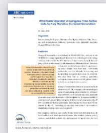
Case Study: Wind Farm Operator Investigates Time Series Data to Help Monetize Curtailed Generation