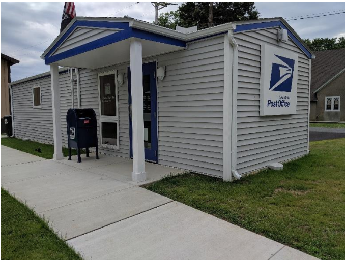
Photo of the new post office on Third Street.