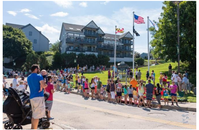
Crowds line up for the parade at Betterton Day 2018.