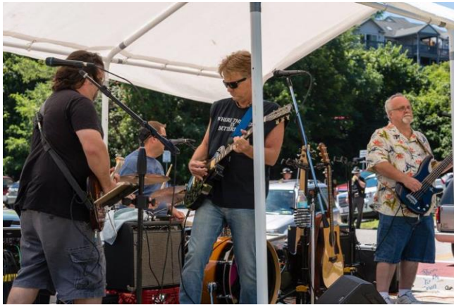
Daytripper plays at Betterton Day 2018

Betterton Weekend will kick off on Friday, August 2 nd with a beach party and fireworks. Saturday, August 3 rd is Betterton Day. You won't want to miss the parade, food, vendors, live music, and famous cow plop bingo. We hope to see you there!