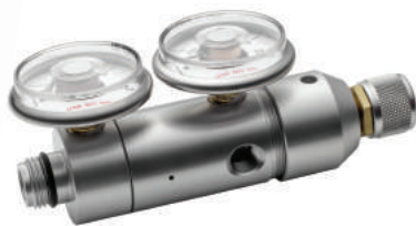
(part number 50-11422 shown above with integrated C10 inlet connection)