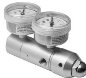
(part number 50-12705 shown above with tamper resistant acorn nut)