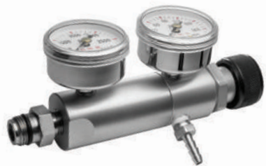
(part number 50-12070 shown above with optional C10 inlet adapter)

1590 99th Ln NE, Minneapolis, MN 55449 763-786-4020