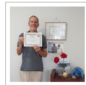
Diploma Graduate 2017

Sherril tailored the classes to our needs – on time, with enlightening material and in a delivery style that was fun and exciting!"