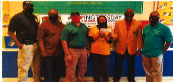
Ta-Seti Temple #253 presents annual donation

_____ $1,500.00 _____ $150.00 _____ $1,000.00 _____ $100.00 _____ $500.00 _____ $50.00 _____ $250.00 $ _____ (other)