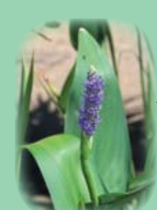
Joseph M. DiTomaso

Heart-shaped leaves surround dramatic flower spikes. Excellent filtration ability. Place in containers in 1 foot of water. 3 to 4 feet tall, 2 to 2½ feet wide.