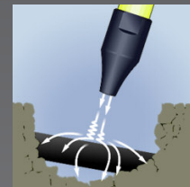
As the cable or utility is exposed, the air stream hits its non-porous shielding, compresses, and harmlessly dissipates in the soil that surrounds the cable.