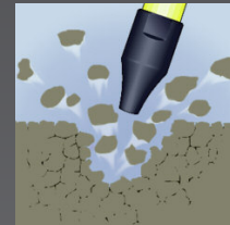
The crevices explode from the energy built-up from the forced compressed air, crumbling the soil and leaving it dry for easy vacuuming and backfilling.