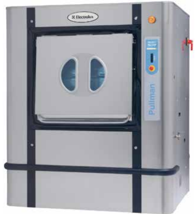
Images shown are a representation of the product only and variations may occur.