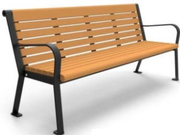
Bench with back: $950.00

The cost of memorializing a bench with a back is $950.00. Commemorative plaques are installed on the back of the bench facing forward. The cost for memorializing a backless bench is $700.00. The plaque will be affixed to the seat of the bench.