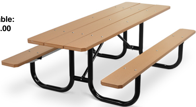
Long table: $1,000.00