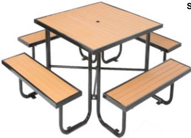
Square table: $1,200.00

The long picnic tables are from Belson Outdoors. They are six feet long and constructed with recycled plastic with black enamel frames. The cost of memorializing a long picnic table is $1,000. Plaques are affixed to the middle of the table top.