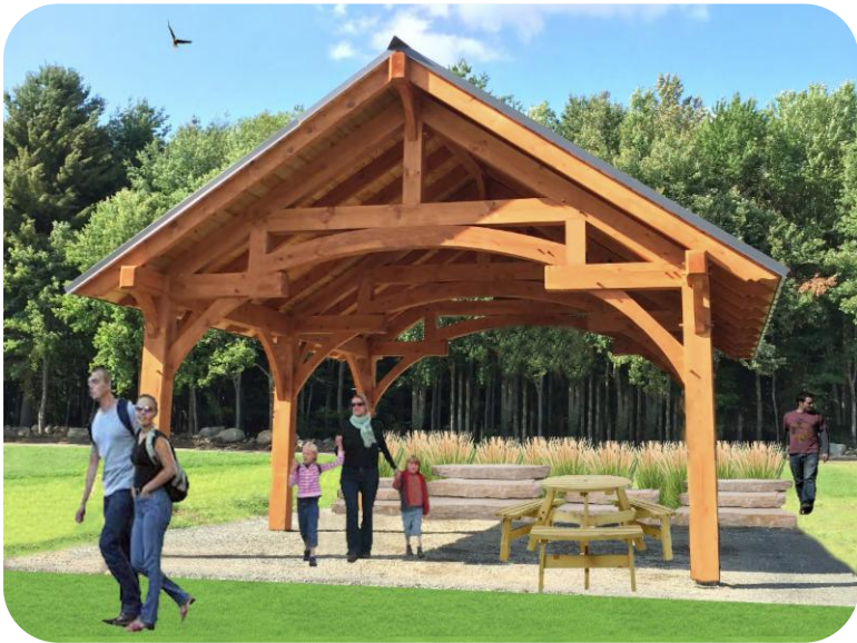
(Preliminary Design Pictured Above)

Individuals who are interested in memorializing or sponsoring the pavilion should contact the Wind Point Village Office at 262-639-3524 for more information