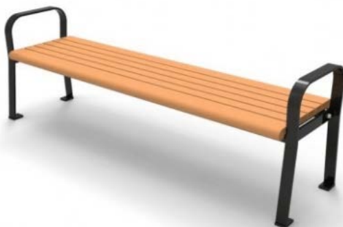
Backless bench: $700.00