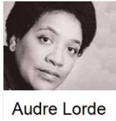
Google: Audre Lorde