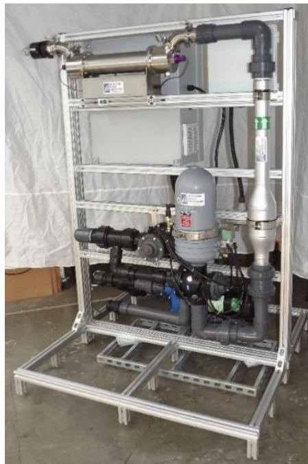
Figure 2 – Industrial Water Innovation's Cooling Tower Skid, 4x4 ft.

addition of UV will not eliminate biofilm, the use of UV systems will keep a cooling tower free of pathogens and prevent the buildup of biofilm. ASHRAE recognizes UV as a treatment method for the control of legionella.