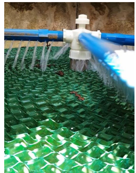
Figure 3 – Inside of Cooling Tower

The filter is an automatic backflushing poly-disc design that requires no manual cleaning or maintenance and can drastically reduce or even eliminate blowdown in many applications. This process reduces the amount of water consumed to the makeup water to cover evaporation, plus a few gallons for the filter flush