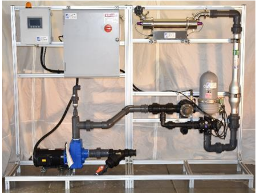
Figure 1 – Industrial Water Innovation's Cooling Tower Skid, 2 x 8 ft.

The basic process by which a cooling tower removes heat is through the evaporation of water. This lost water needs to be replenished on a regular