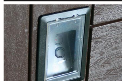
BLUETOOTH AUDIO SYSTEM