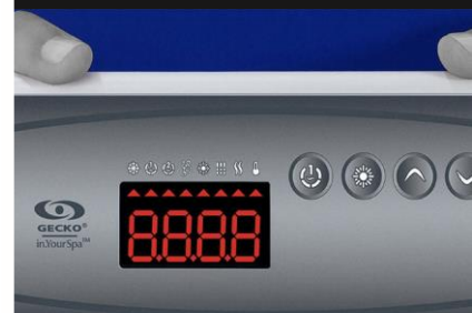
USER FRIENDLY, DIGITAL CONTROLS