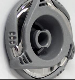
STAINLESS STEEL JETS