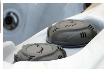
AIR & WATER DIVERTERS