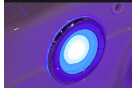
UNDERWATER LED LIGHTING