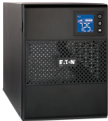
500–1500 VA tower with LCD