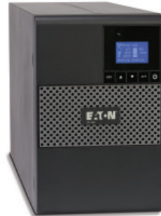
Tower: 750–3000 VA