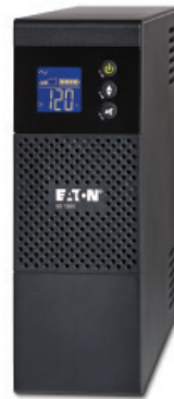
700–1500 VA models with LCD