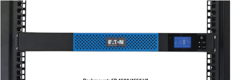
Rackmount: 5P 1500/1550 VA