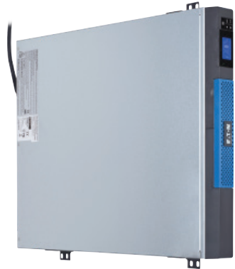
Wallmount: 5P 1500/1550 VA