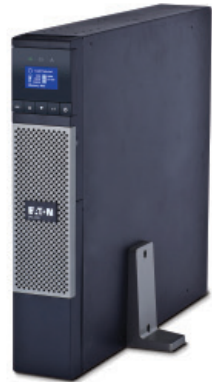
Tower: 1000–3000 VA