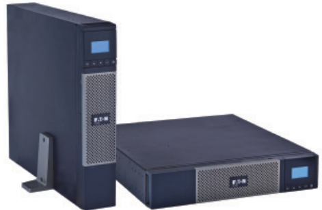
2U rackmount/tower: 1440–3000 VA