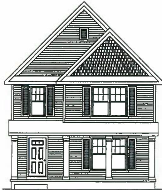
FRONT ELEVATION 1820 TOTAL SQ. FT.