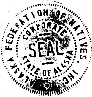
Julie Kitka President

NOW THEREFORE BE IT RESOLVED that the delegates of the 2019 Annual AFN Convention urges Congress to authorize funding for the Indian Housing Block Grant (IHBG) at no less than $800 million, with subsequent fiscal year increases of $50 million per year until inflationary reductions have been recovered.