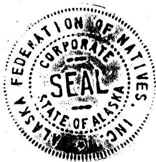
Julie Kitka President

NOW THEREFORE BE IT RESOLVED that the delegates of the 2019 Annual AFN Convention calls on the United States Department of the Interior and the State of Alaska to each fulfill their obligations to Alaska Native Tribes and communities in Rural Alaska by adequately and equitably resourcing public safety infrastructure in Tribal communities in Rural Alaska.