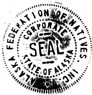
Julie Kitka President

NOW THEREFORE BE IT RESOLVED that the delegates of the 2019 Annual AFN Convention that AFN urge the Governor of Alaska to retain the appropriation for ASCA in his proposed FY 20201 budget at the FY 2020 level at minimum, and urges the Alaska Legislature to appropriate that funding at the FY 2020 level at minimum in support of the Alaska State Council on the Arts.