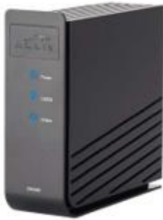
Arris CATV Modem