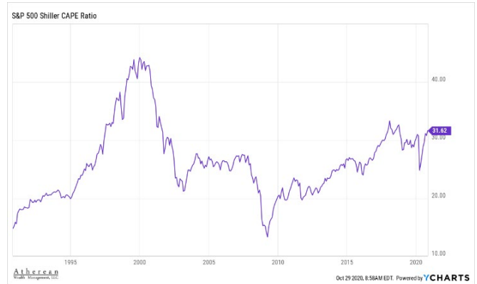
Figure 2: S&P 500 Shiller CAPE Ratio Q3 1990 – Present