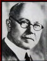
Claude C. Hopkins

The Book Recommended By More Advertising Geniuses Than Any Other