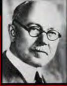
Claude C. Hopkins