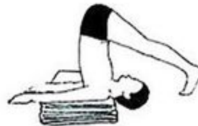
Halasana 5 min.