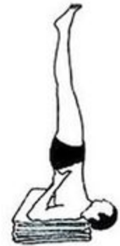
Salamba Sarvangasana Cycle 5 min.