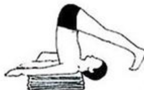
Halasana 5 min.