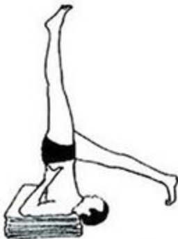
Salamba Sarvangasana Cycle