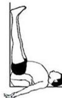
Viparita Karani 5 min.