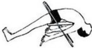
Dvi Pada Viparita Dandasana 5 min.