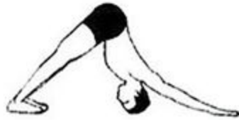
Adho Mukha Svanasana 5 min.