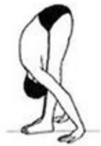
Uttanasana 5 min.