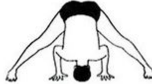
Prasarita Padottanasana head down 3 min.