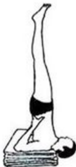
Salamba Sarvangasana 10 min.