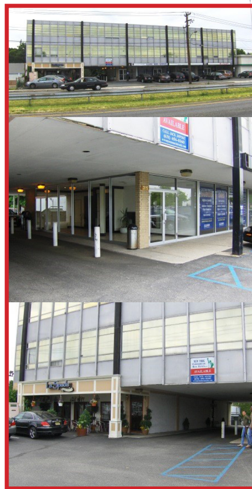
The property at 315 Walt Whitman Road in Huntington

For more information about the properties that are currently available, call New York Commercial Real Estate at 631-656-0360 or visit www.NYCRELI.com .