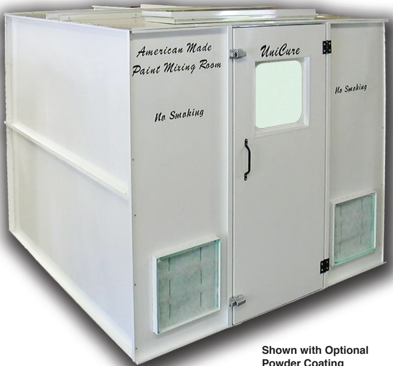
Shown with Optional Powder Coating