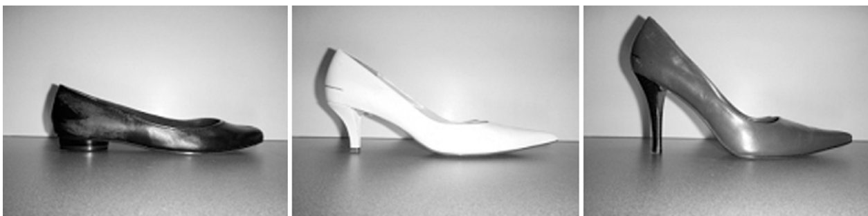
Fig. 1. The three shoe designs used in this study: low heel (left: 1.27 cm), medium heel (center: 6.35 cm) and high heel (right: 9.53 cm).

The ANOVA comparing patellofemoral joint reaction force at the time of peak stress among the 3 shoe conditions was significant ( p = 0.001 ; Table 1). During the high heel condition, patellofemoral joint reaction force at the time of peak stress was significantly greater when compared to medium heel ( p = 0.000 ) and low heel