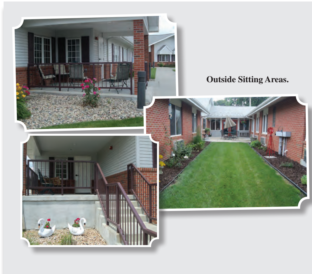
Outside Sitting Areas.