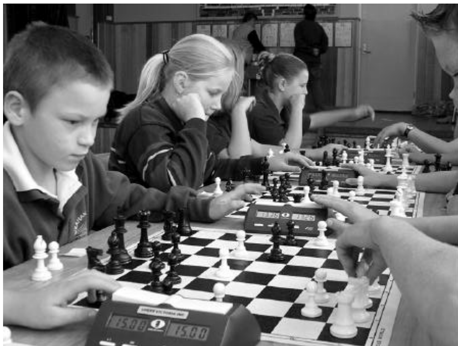
Interschool Chess events are thriving all over Australia.

Apply to china@chesskids.com.au by May 15 for details.