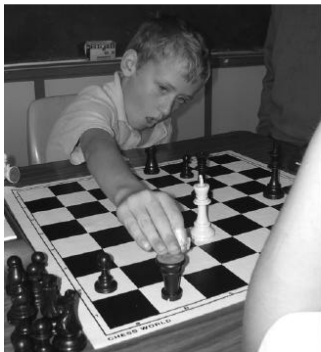
A real stretch. Only just managing to get a new queen.