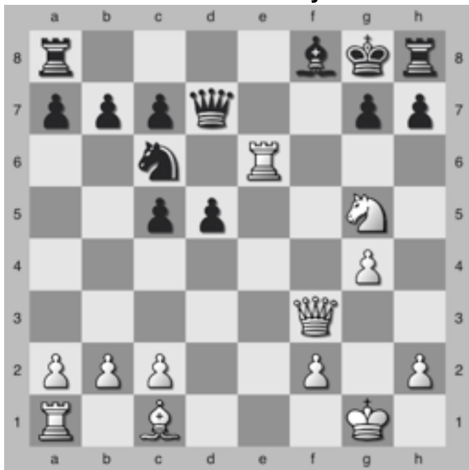
#1 White to Play