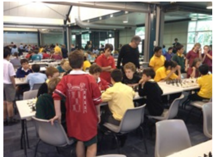
350 players crowded into the venue...

http://tornelo.chesskids.com.au/tournaments/state-finals-open-primary