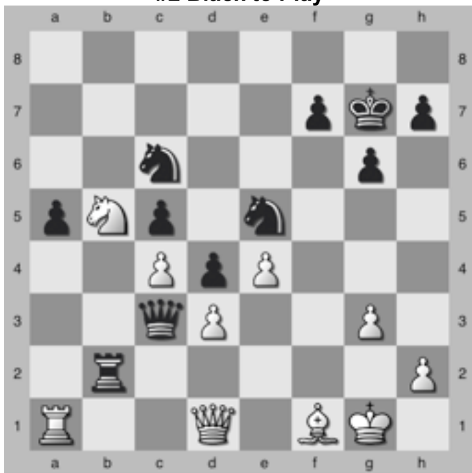
#2 Black to Play