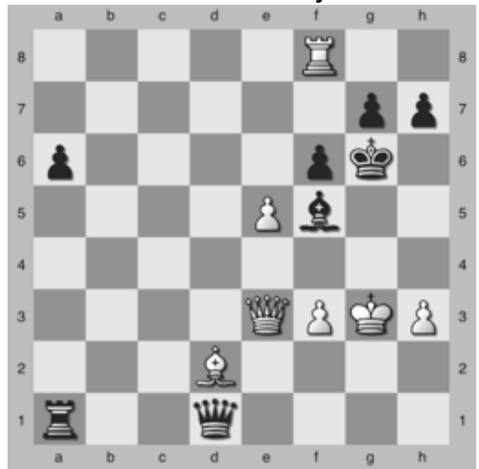
#3 White to Play