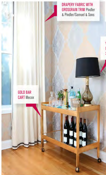
DRAPERY FABRIC WITH GROSGRAIN TRIM Pindler & Pindler/Samuel & Sons

Couture-clothing-inspired prints, combinations of standout colors and the mix of modern and vintage make the Worman home appear to be not too cramped, and certainly not too sparse, but to have just the right dose of high fashion home accessories. ■