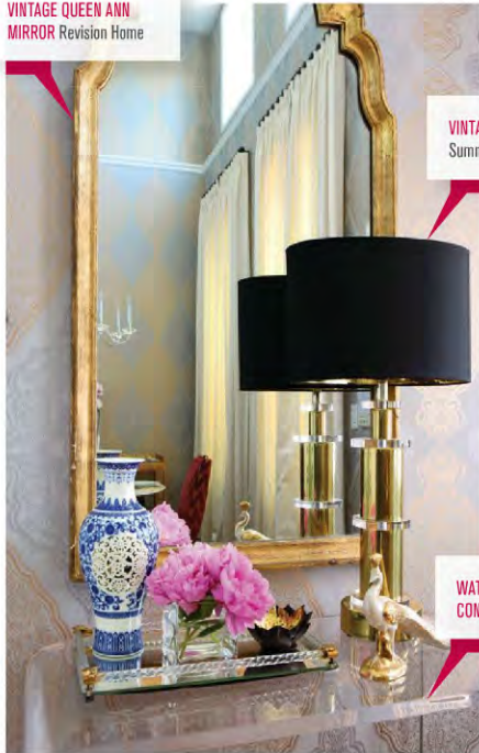
VINTAGE QUEEN ANN MIRROR Revision Home