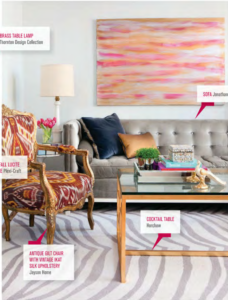
SOFA Jonathan Adler