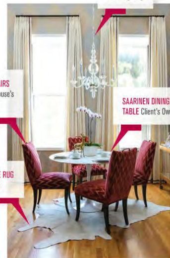
COWHIDE RUG West Elm