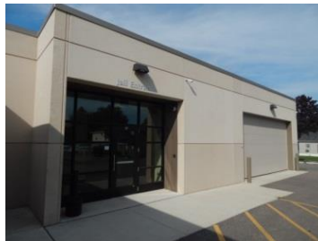
(Main Entrance to Redwood County Jail)