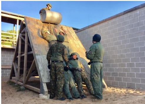
Members of BLRR ERU and Crow River SWAT participate in a team building exercise during Basic SWAT training at Camp Ripley