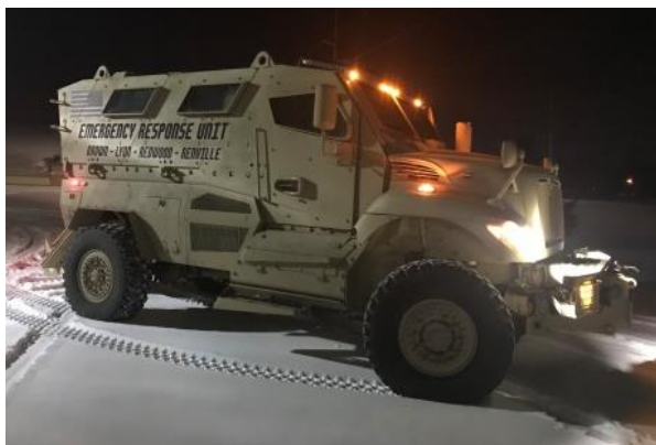
(MRAP - Mine-Resistant Ambush Protected)

The MRAP was acquired by the Renville County Sheriff's Office in October of 2016. It was de-militarized and then modified for civilian police work, including additions of emergency lighting, PA system, radios, etc. It was put into service with the BLRR ERU in March of 2017.